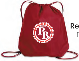
Red Cinch Pack Price: $8.00