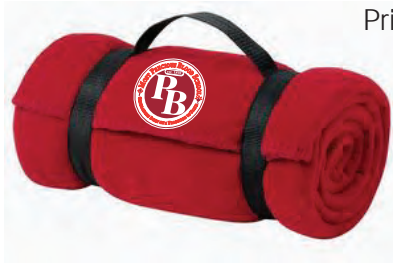
Red Fleece Blanket Price: $27.00