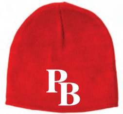
Beanie Colors: Red, Charcoal Price: $12.00